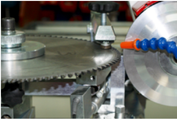
Circular saw blade refrigeration. The machine can be optionally equipped with refrigeration system which includes tray, coolant tank and pump.