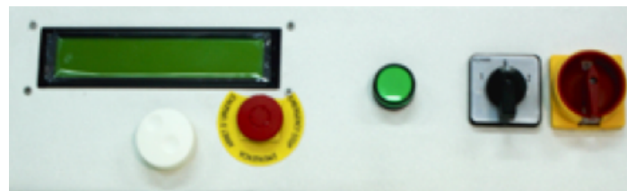
LCD display with an easy programming of grinding process.