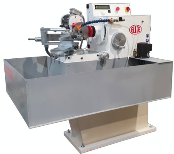
Collection tray for coolant.