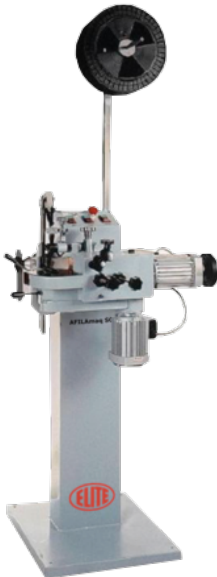
Image 1: frontal control panel, with only the necessary buttons for very easy handling.

Image 2: setting machine installed on the grinding machine, as optional.