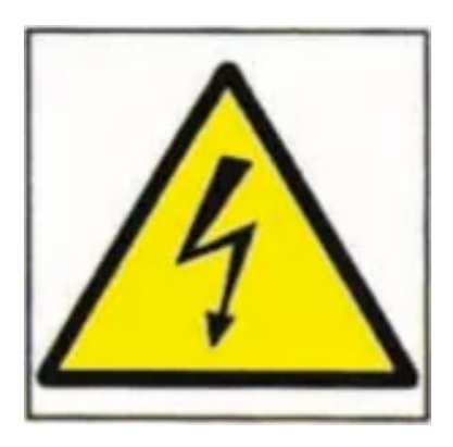
DANGER HIGH VOLTAGE!

SOLDAmaq welding machines must be strictly connected to the voltage indicated in the machine order and on the machine itself. The connection to a voltage other than that indicated may cause a breakdown in the machine and represents a risk for people who use the machine.