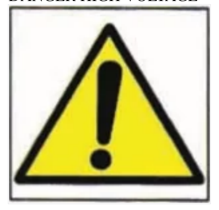
DANGER OF ACCIDENT