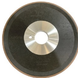
Grinding wheel for face grinding

For face grinding face we recommend the following reference: 2132-A. 12V9 20° D76 C125 \varnothing 175 \times 2.9 \times 13 \times 13 \times \varnothing 32 mm.