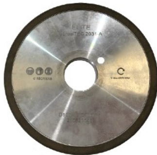
Grinding wheel for top grinding

For grinding the top of the teeth we recommend the following reference: 2031-A. 14B1 D107/46 \varnothing 150 \times 8 \times 5 \times 10 \times \varnothing 32 mm.