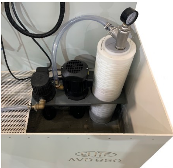
Filtering system integrated in the machine to save space.