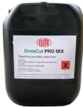
SintoCut PRO MIX 20 L

We recommend to use ELITE SintoCut PRO MIX or equivalent to mix with water emulsion.