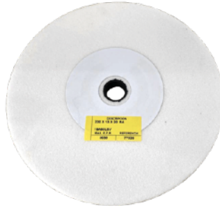
Back-off grinding wheel

For back-off grinding we recommend the following reference: 2410-A. 1A1 \varnothing 180 \times 4 \times \varnothing 32 mm.