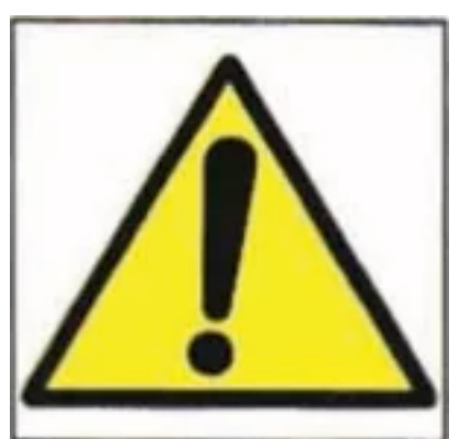
DANGER OF ACCIDENT